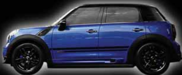
2016 Countryman S All 4